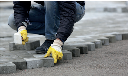
Laying a patio