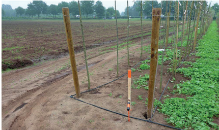
Planting a hedge