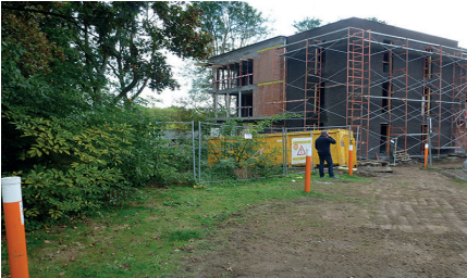
Building a house