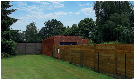
Putting up a fence