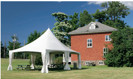
Setting up a marquee