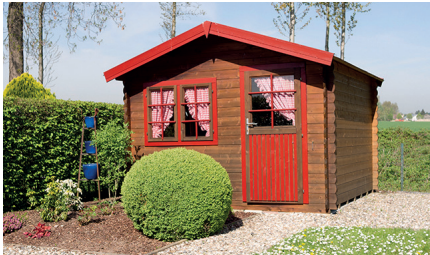
Building a garden shed