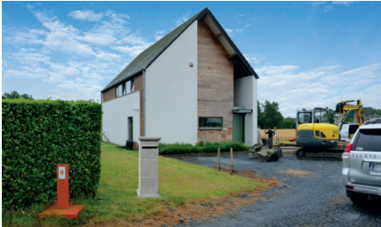
Installing a letter box