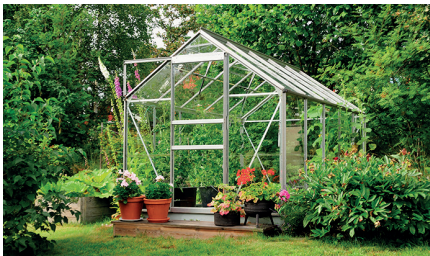
Building a greenhouse