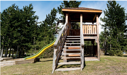
Building playground equipment