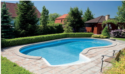
Digging a swimming pool