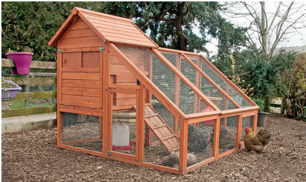
Building a chicken coop